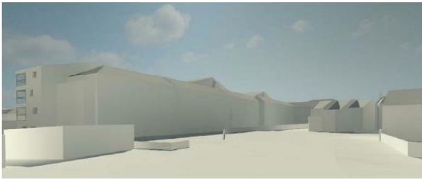
At five storeys the tips of the central blocks are just about visible, peaking over the ridge line of the existing Woodridings Court building.