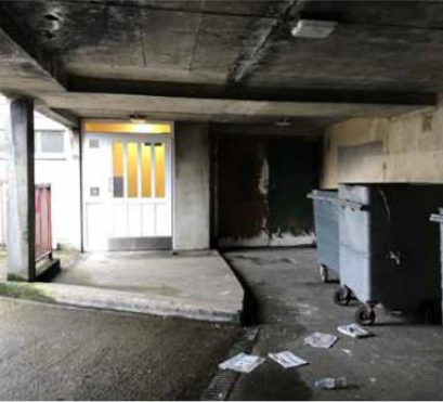
Rear pedestrian access is uninviting.