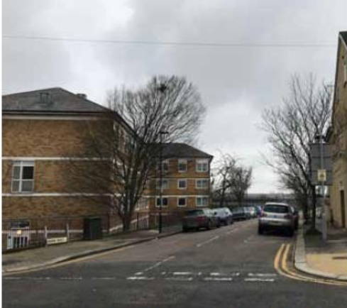
Dagmar Road view showing the ground level against the building.