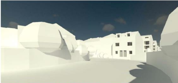
Dagmar Road view looking north with the pavilion blocks in the background