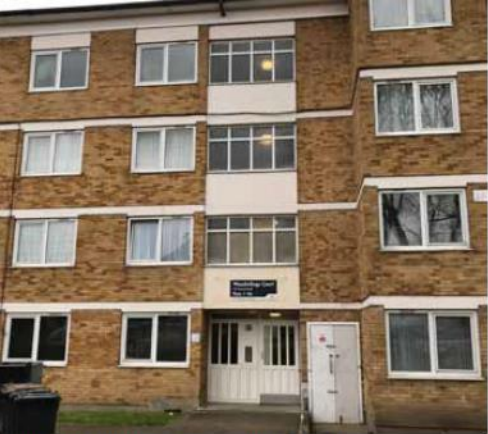
Central main entry point at the front of the building.