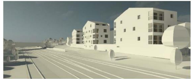
View from North across the railway to where the scheme is most visible and a vast improvement over the existing parking decks.