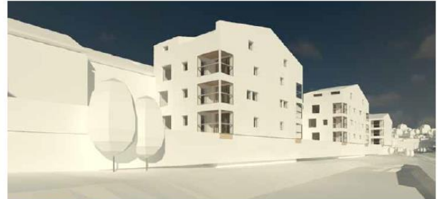
View from South across the railway.