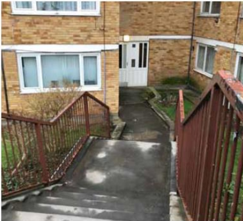
Steps down from Dagmar Road to the ground floor entrance.