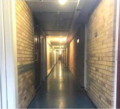
Ground and first floor corridors are dark and unpleasant.