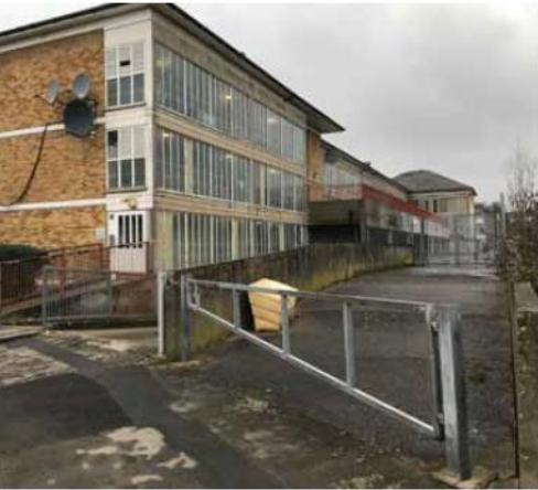
Dagmar Road access ramps to the disused parking areas.